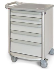
M3 – 350 CARDS